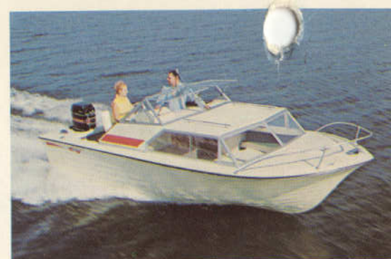
MODEL 1119 — C